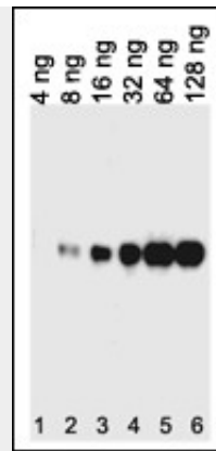
Western blot analysis of lysates from 12tag protein, This demonstrates the His tagged antibody detected the His tagged protein (arrow).